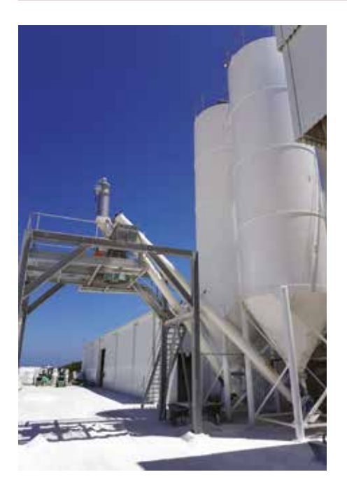
his is a successful installation by Kimrae Engineering for a calcium carbonate production plant

at Port Shepstone in the KwaZulu-Natal region. Port Shepstone is also known as "The White Rock Hill of Natal" due to its unique limestone deposits, which are suitable for the production of high-quality calcite and dolomite products. The Marble Delta is the main source of limestone mined in KwaZulu-Natal, and this limestone is the highest quality one can find in South Africa.