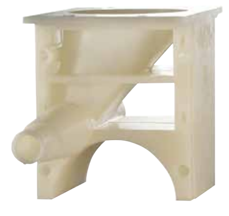
SINT<sup>™</sup> body of MBW micro-batch feeder

industry, where plastics usage has been rising steadily since the second half of the 20th century (source: "Plastics