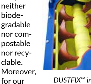
DUSTFIX<sup>™</sup> inside view

ous production we need about 60 different types of raw granular materials. We use both commodities and compounds to make engineering polymers and create recipes or formulas for generating of approximately 2,000