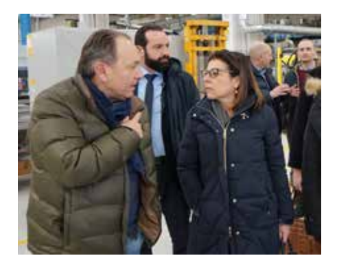
Stefano Cavicchioli with the Italian Minister of Infrastructure, Paola De Micheli, on her visit at the WAMGROUP® headquarters in Ponte Motta in January 2020

Since the very beginning, TECNO CM produced for WAMGROUP®'s dust collector division filter elements in addition to engineering polymer components. Indeed, the volume of filter elements took and still takes up by far the larg-