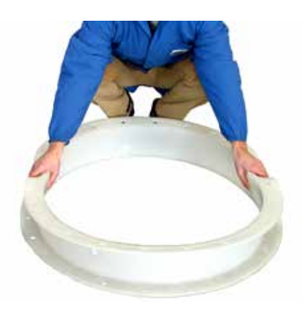
Flanged bin activator gasket