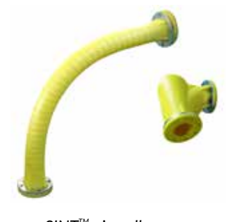
SINT<sup>™</sup> pipe elbows

mise the components it manufactures in terms of quality and costeffectiveness. To achieve this