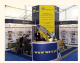
WAM Polska at WOD-KAN

again this year with their own stand from May 29th until 31st in Bydgoszcz. A large number of visitors from the sector who came to visit the