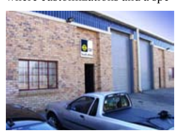
OLI South Africa

moved to new premises across the road from WAM Spain. Then OLI Vibra in Malta was set up. OLI Romania followed where customizations and a spe-