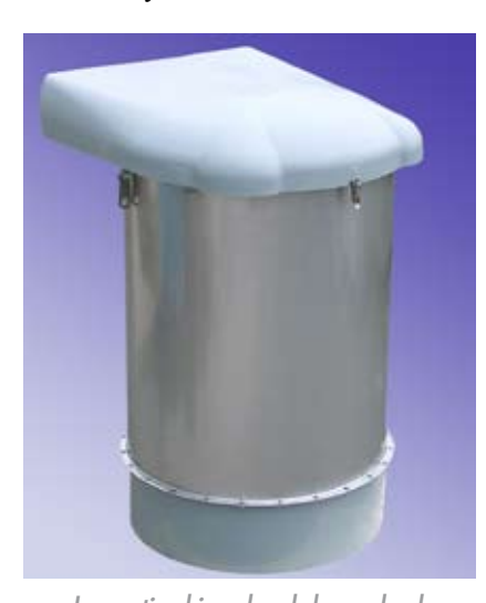
Innovative hinged and clamped polymer weather protection top cover

The new SILOTOP® R02 is the result of further industrialisation of a silo venting filter that in terms of quality and performance features is second to none anywhere in the world.