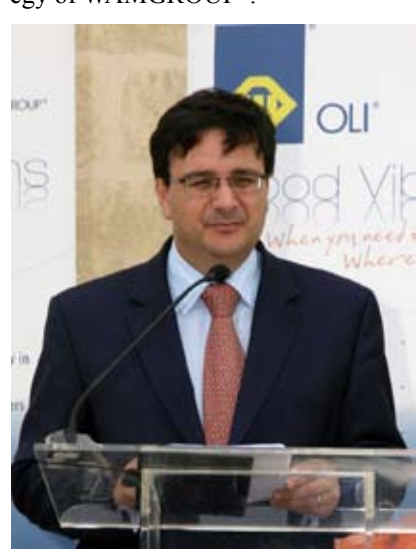
Minister Tonio Fenech

internationalisation and globalisation of OLI® following the corporate strategy of WAMGROUP®.