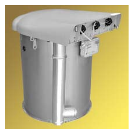
Optional exhaust pipe and ducting system for safe dust emission checks

The new SILOTOP® model continues to offer some of the outstanding benefits which were already present in the previous version: