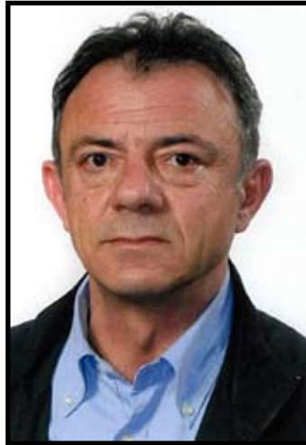
the development of WAMGROUP® will always be remembered.