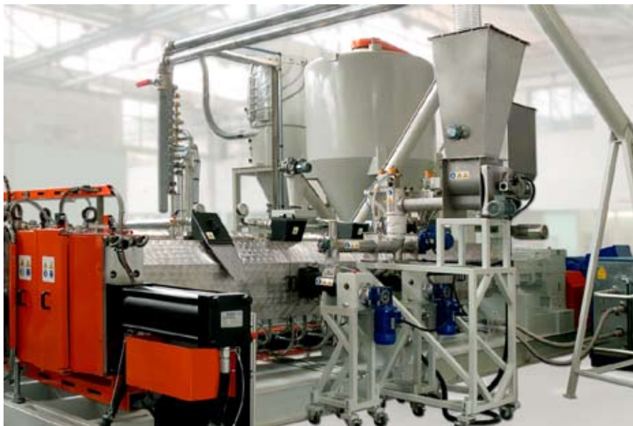
Additive Metering Installation in France

The solution was to install on the extruder an MBF Micro-Batch Feeder specifically designed for continuous powder feeding, one of the range of equipment for bulk solids handling in plastics processing offered by WAMGROUP®. The device fulfils all the requirements in terms of performance, reliability and operating features. With the same unit the user can feed single materials or blended compounds thanks to great machine flexibility and comfortable access to its internal components which makes material change