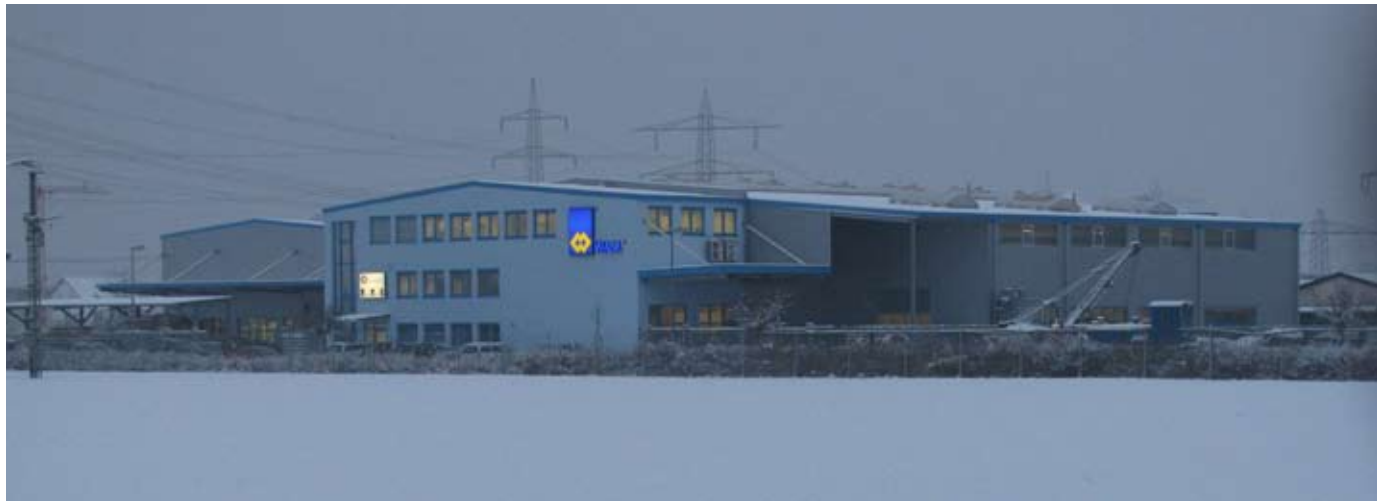
WAM GmbH and EMT GmbH before sunrise in January 2010

SERVING THE GERMAN AND AUSTRIAN MARKETS SINCE 1986