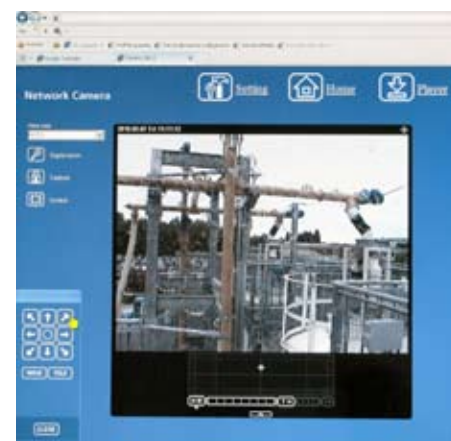
Remote Webcam Control Via Internet