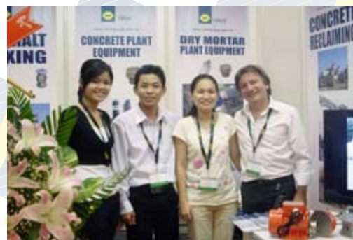
The WAM Vietnam Team at the Show