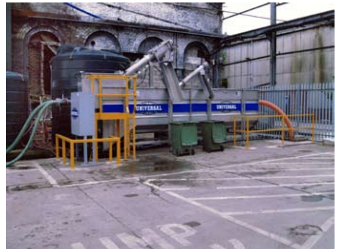
WASTEMASTER® TSF on site in Liverpool