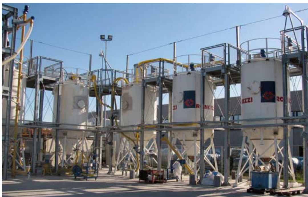
Test Plant for Process Simulation in Ponte Motta, Modena, Italy

THE LATEST STATE-OF-THE-ART TECHNOLOGY IN TELECOMMUNICATIONS AT THE SERVICE OF WAMGROUP® CUSTOMERS WORLDWIDE