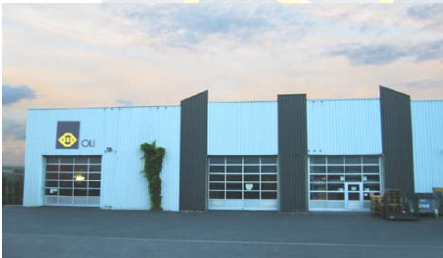
OLI Vibrationstechnik GmbH in Hünfelden

www.wamgmbh.de www.emtgmbh.de www.oligmbh.de