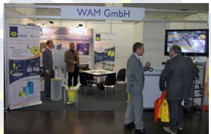
The WAM® stand at SCHWEISSEN & SCHNEIDEN

For WAM® it was an opportunity not to be missed for presenting its Filter