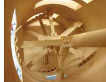
Special tool arrangement