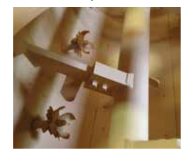
Removable anti-wear liner