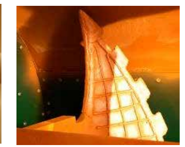
Special mixing tools