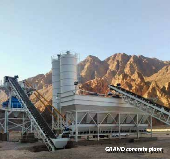
GRAND concrete plant