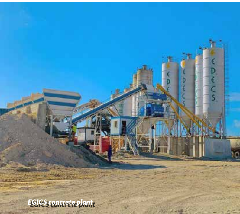
EGICS concrete plant