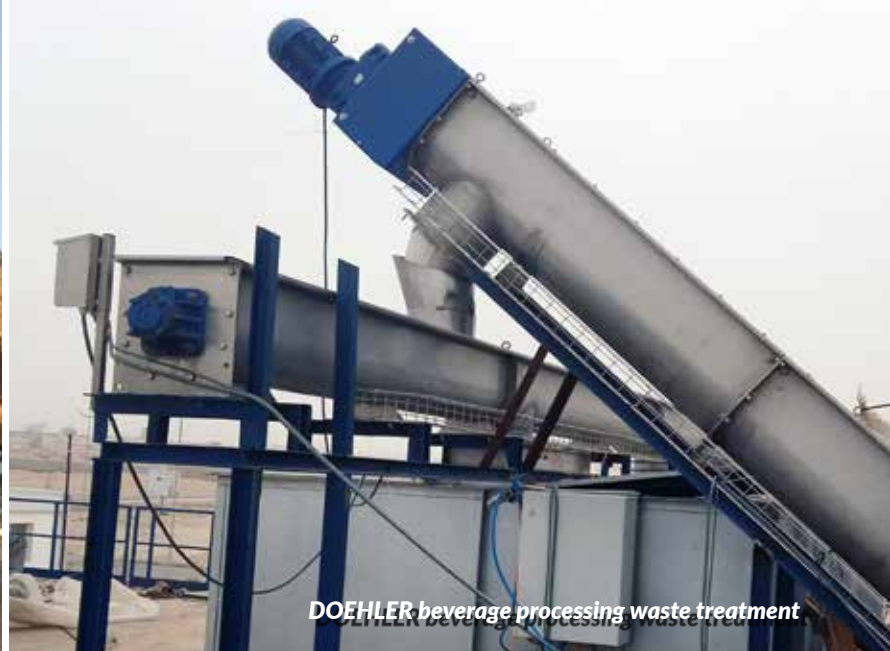
DOEHLER beverage processing waste treatment