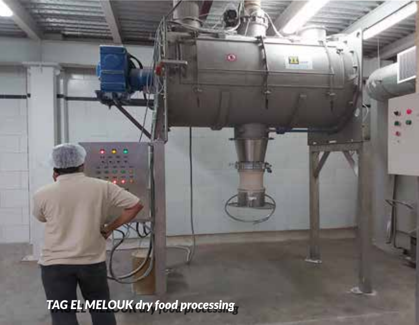
TAG EL MELOUK dry food processing