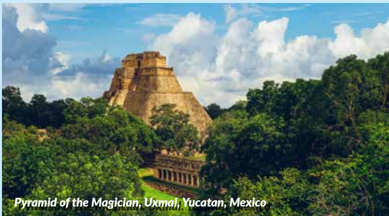
Pyramid of the Magician, Uxmal, Yucatan, Mexico

In 2011, WAMGROUP® invested in its own subsidiary in Mexico to strengthen its presence in Latin America and expand its market share. The move aimed to capitalise on Mexico’s growing industrial sector, particularly in construction, food processing, and mining.