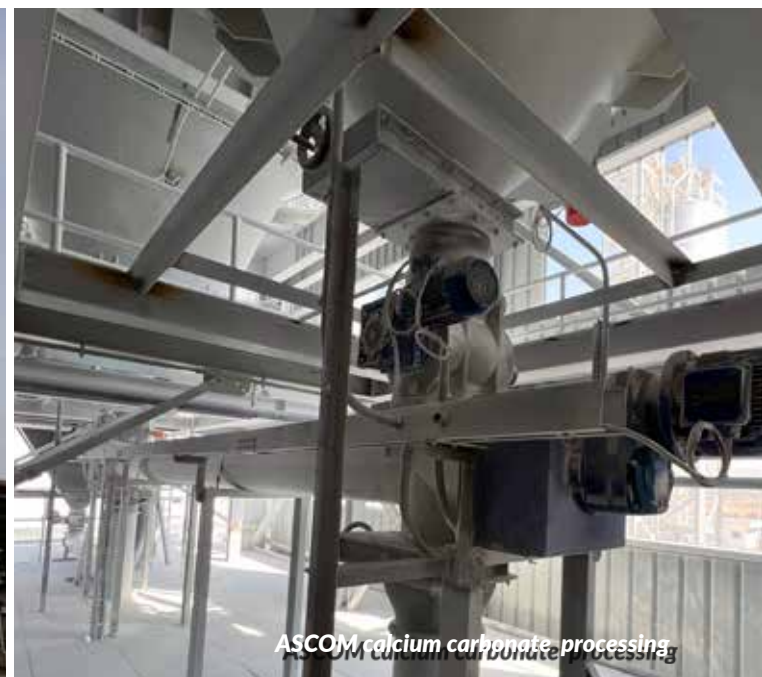
ASCAM calcium carbonate processing