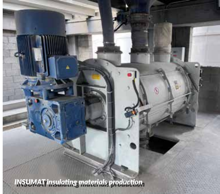
INSUMAT insulating materials production