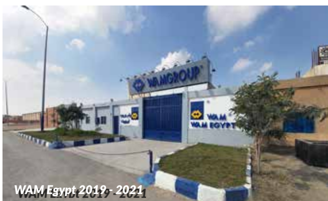
WAM Egypt 2019- 2021