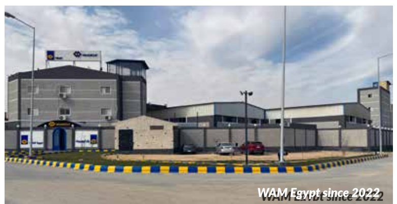
WAM Egypt since 2022