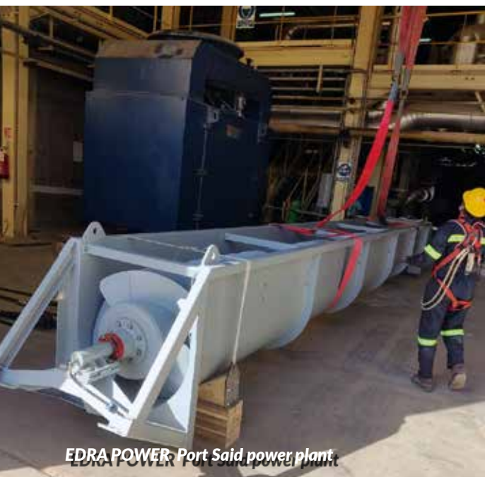
EDRA POWER, Port Said power plant

EGICS GROUP , SPHINX , and GRAND are recognised leaders in manufacturing concrete batching plants for ready-mixed and pre-cast concrete. These prominent companies have trusted WAM Egypt's expertise for years, benefiting from their reliable solutions. WAM Egypt is proud to be part of the WAMGROUP®'s more than fifty-year history as a supplier to the industry.