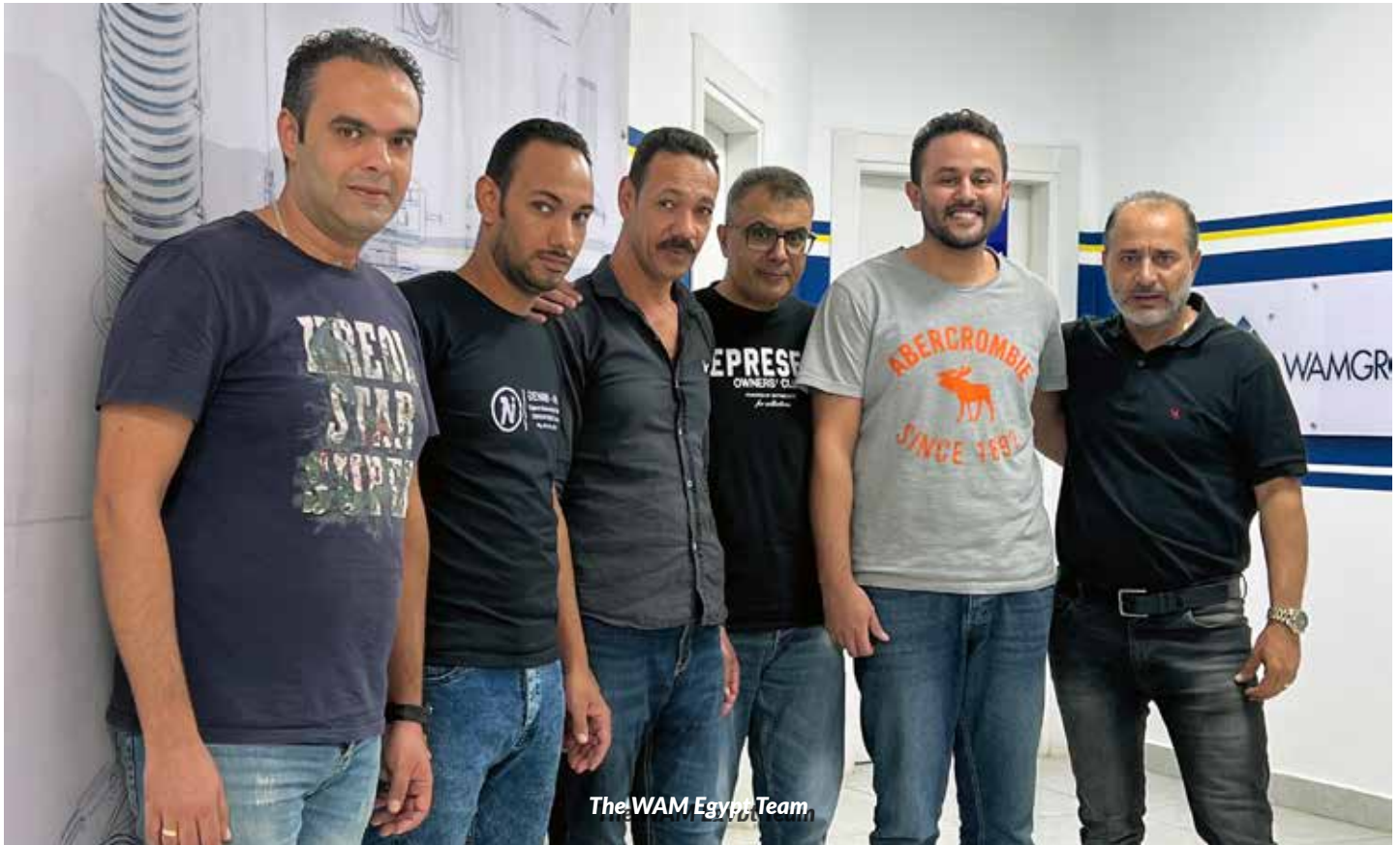
The WAM Egypt Team

Established in 2011, WAM Egypt's inception coincided with the turbulence of the Arab Spring and the ensuing Egyptian uprising, which led to the collapse of the government. The period of instability gripped the nation until 2013, with significant economic fallout.