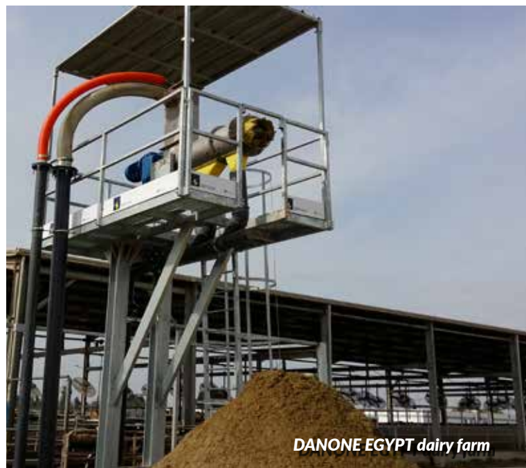
DANONE EGYPT dairy farm