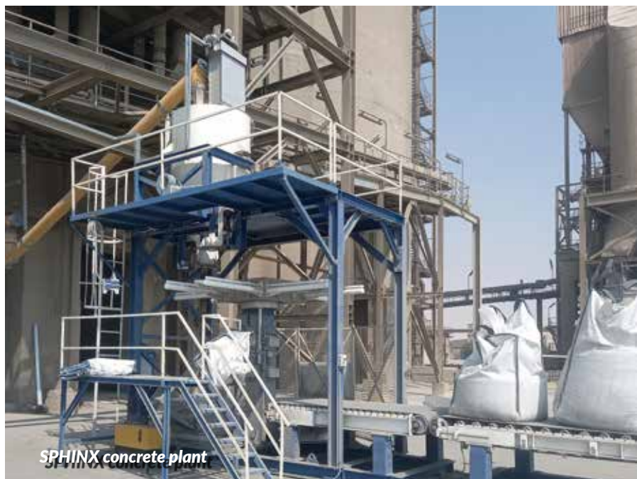
SPHINX concrete plant