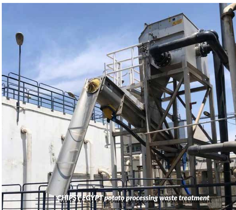
CHIPSY EGYPT potato processing waste treatment

At the Port Said East Power Plant, EDRA POWER ensures efficient water lifting with two 800mm-diameter Archimedean screw pumps by SAVECO®, exemplifying cutting-edge engineering.