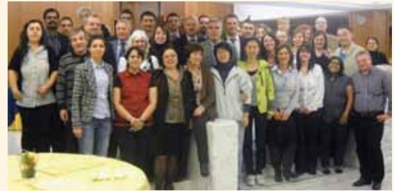
Finance Workshop Participants

For the first time the WAMGROUP® Management organized a workshop for accountants and financial administrators from WAMGROUP® subsidiaries all over the world. Undoubtedly figures don't have to be translated but in a group with more than fifty companies financial controlling has become essential. To develop a common language and share a comprehensive glossary was the starting point which was followed by harmonization of the tools.