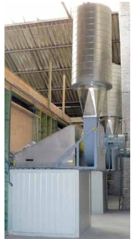
WAMAIR® Dust Collectors with large-size cylindrical silencers mounted on top of the fan exhausts