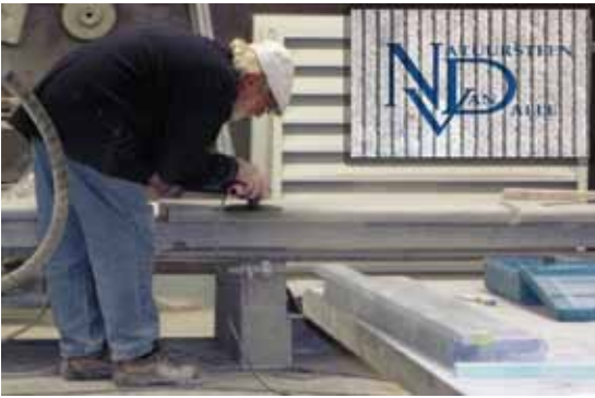
Working the slabs at the Van Daele workshop

Craftsmanship seems to be more in demand than ever. In modern times health and safety are not only an issue for industrial manufacturing processes but also in artisan workshops where workers are exposed to risks.