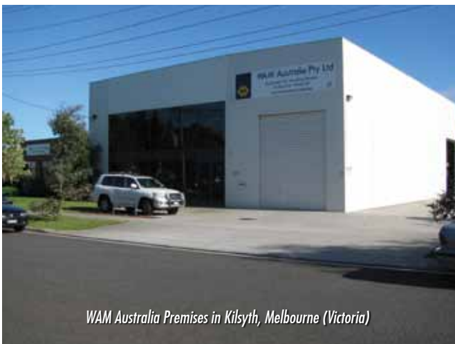
WAM Australia Premises in Kilsyth, Melbourne (Victoria)