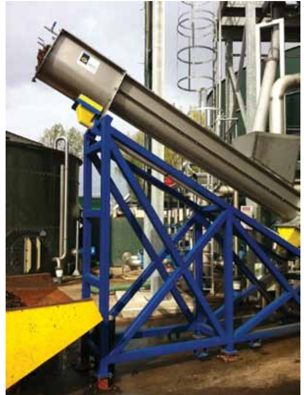
CPS installation at UBL (Heineken) in Ledbury, U.K.

The customer, Universal Beverages Ltd., is delighted with the results. The detritus is no longer thrown away, it is sold to and collected by a local farmer to be used as fertilizer. Whereas before