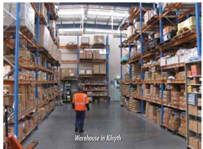
Warehouse in Kilsyth