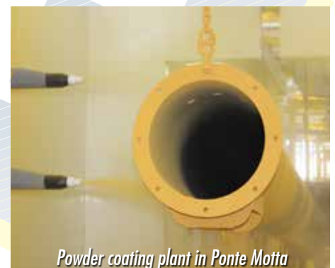
Powder coating plant in Ponte Motta

With the screw conveyors coming home Ponte Motta has reached again its full production capacity.