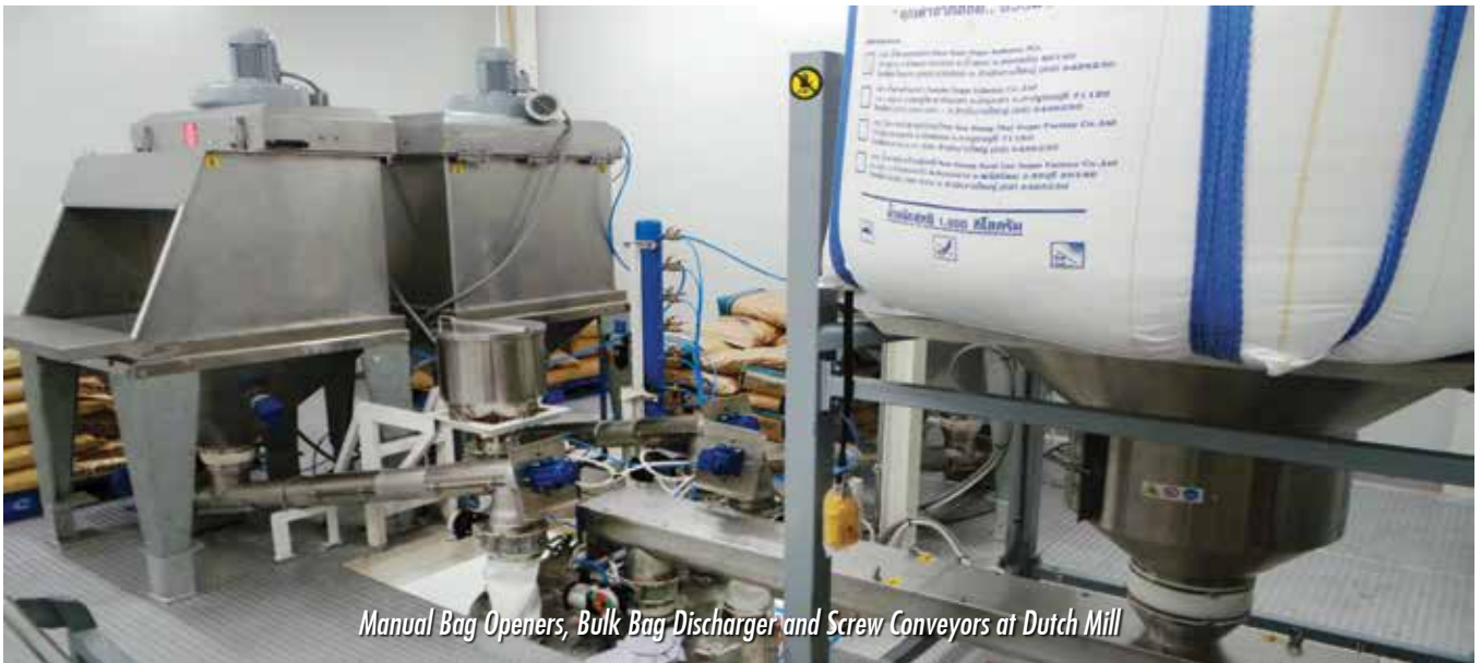
Manual Bag Openers, Bulk Bag Discharger and Screw Conveyors at Dutch Mill