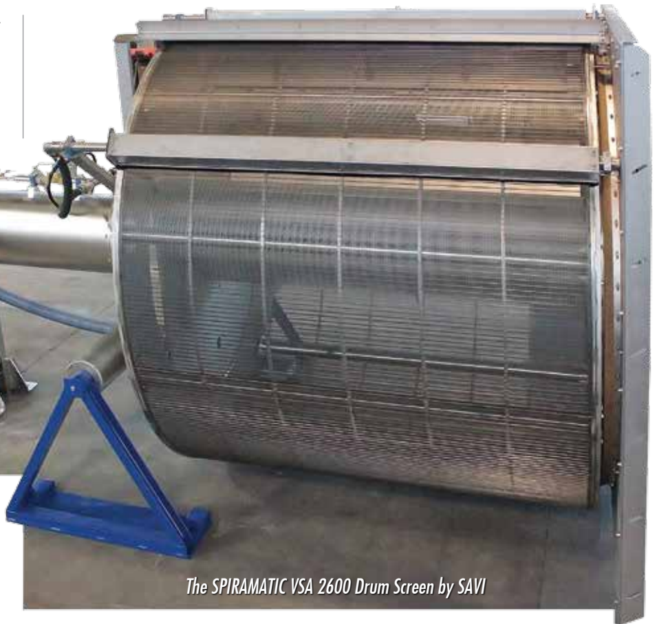
The SPIRAMATIC VSA 2600 Drum Screen by SAVI

Thanks to their experience gained over decades, ACEA ATO 2 has developed cutting-edge know-how in the design, construction and management of integrated water systems ranging from spring water to waterworks, from