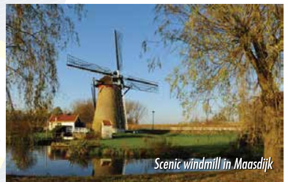
Scenic windmill in Maasdiijk

Since 1999 the Dutch branch has been taking care of a vast customer base in the Netherlands covering various industrial sectors.