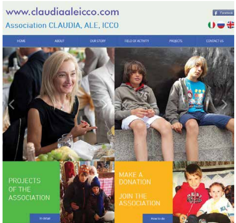
Home page of the association’s website