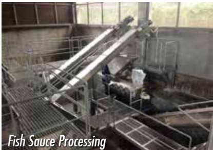
Fish Sauce Processing

one moving clockwise were taken at DUTCH MILL, one of Thailand's largest manufacturers and marketers of dairy products. For the production of dry instant drink mixtures consist-