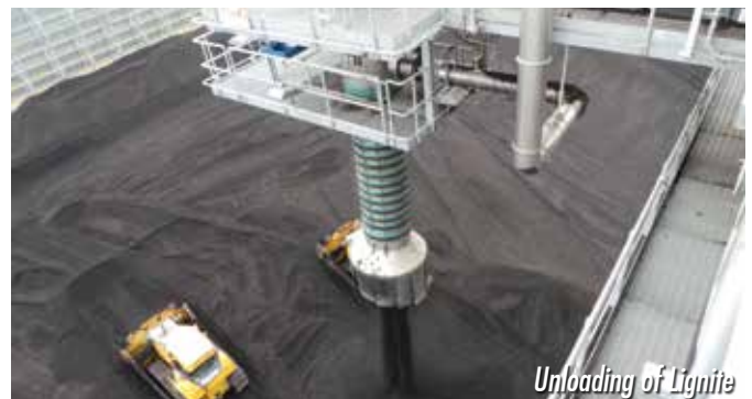
Unloading of Lignite