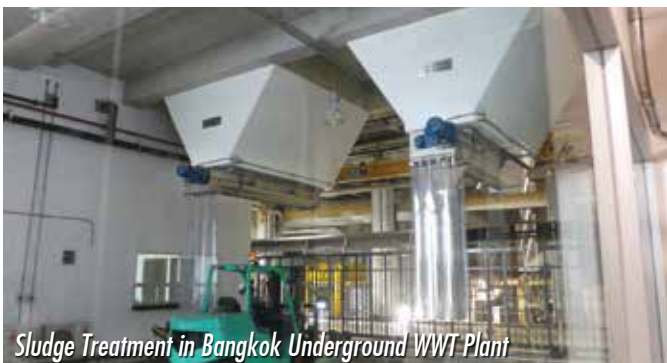
Sludge Treatment in Bangkok Underground WWT Plant

less steel continuous WAH-type ploughshare mixer by MAP® the Thai food producer has been successfully mixing small fresh fish with salt since 2012.