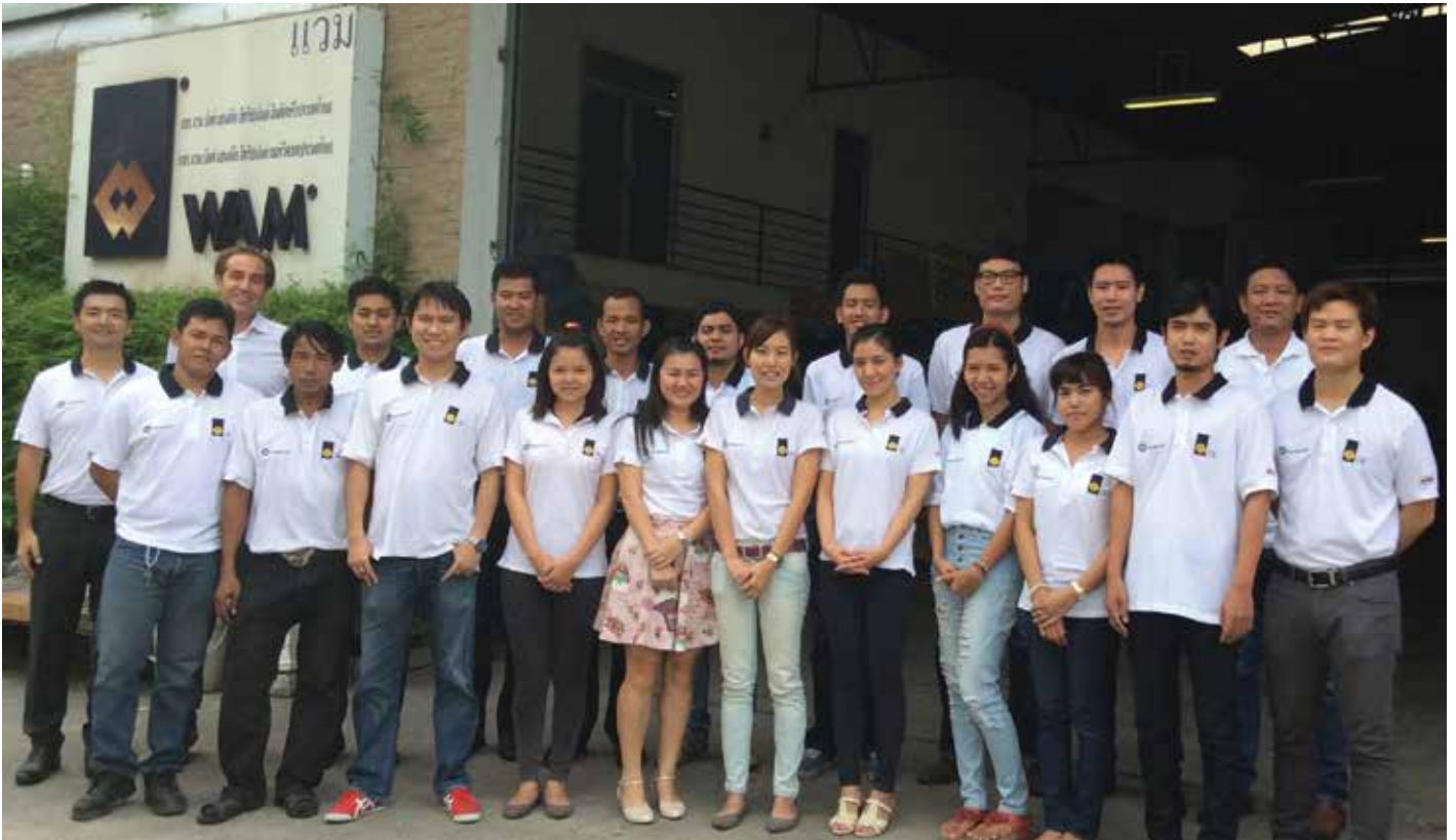
WAM Thailand staff in front of the subsidiary's premises in Bangkok

Ranked number twenty-four among the world's mega-cities, at a population of 14.5 million, Bangkok has developed into one of the main logistic hubs in Southeast Asia. In the past twenty-three years, there has been a large influx of Indians, Pakistanis, Persians, Burmese, Cambodians, Laotians, Indonesians, Malaysians, Nepalis, Filipinos, Chinese and others emigrating to Thailand as well as Bangkok trying to get their fair share of the prosperity produced by the country in the last two decades.