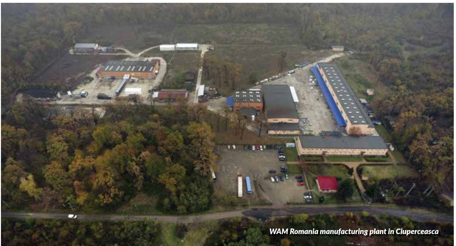
WAM Romania manufacturing plant in Ciuperceasca

In addition to production, the WAM Romania Technical Department makes an important contribution to designing WAMGROUP® machines. Corporate Marketing Communications also rely on the support of WAM Romania's highly competent staff. www.wamgroup.ro