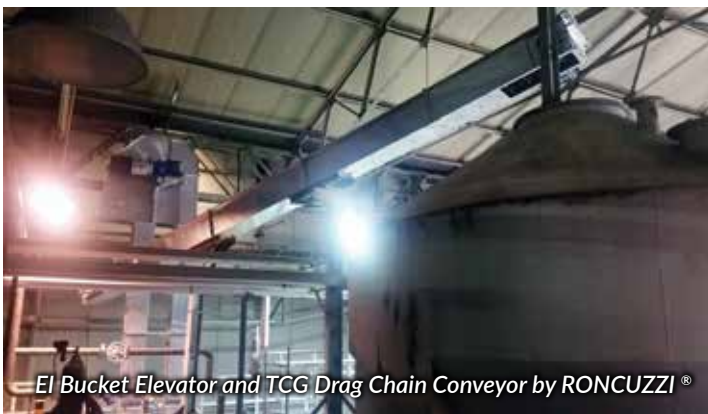
EI Bucket Elevator and TCG Drag Chain Conveyor by RONCUZZI®

Sebeş, Alba County, Romania, October 2017