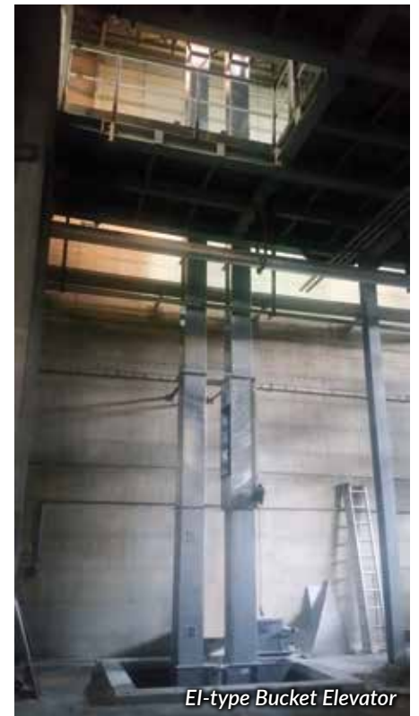
EI-type Bucket Elevator