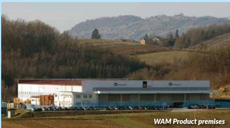
WAM Product premises

Ten years before Croatia finally joined the European Union, WAMGROUP® decided to open a production site in the Balkan nation. Located in Breznički Hum next to motorway E65, a small municipality in the Varaždin County some 50 kilometres from the country's capital, Zagreb, WAM Product has turned into one of WAMGROUP®'s major manufacturing plants. State-of-the art production methods and processes at WAM Product are constantly improved and reflect WAMGROUP®'s concept of global quality management. Read more about WAM Product in the next Newsletter issue.