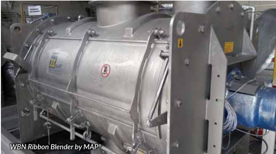
WBN Ribbon Blender by MAP®

Zlatna, Alba County, Romania, since March 2016